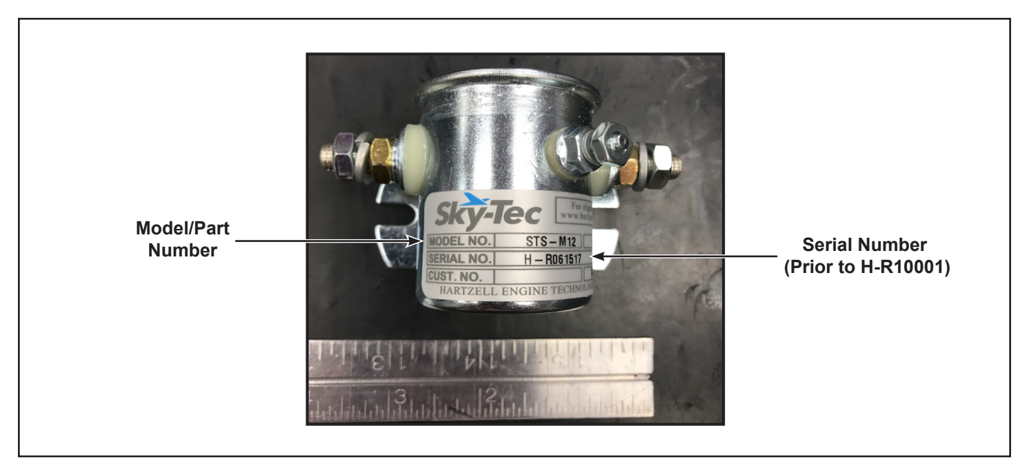
Affected Master Contactor. Model Number STS-M12 Shown. Figure-1