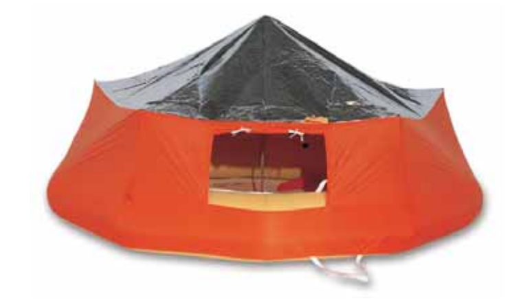
T9 LIFE RAFT Standard Canopy