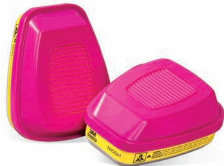
3M™ Multi Gas/Vapor Cartridge/Filter 60923