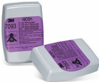
3M™ Particulate Filter 7093