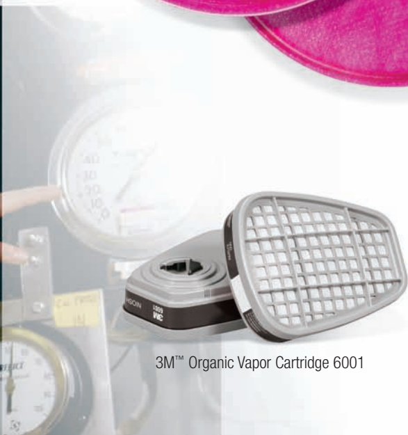
3M™ Organic Vapor Cartridge 6001